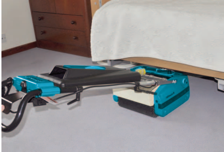
Easily Manoeuvrable, even under hospital beds