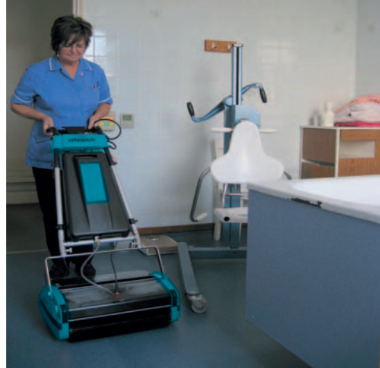
Hygienic clean even in confined areas