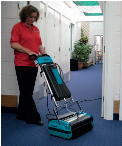
Large carpet areas cleaned fast